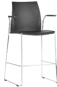
Polypropylene Shell, with arms