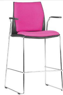
Fully Upholstered shell, with arms