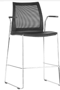
Mesh back, Polypropylene seat, with arms