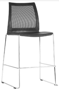
Mesh back, Polypropylene seat