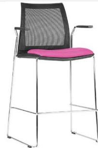
Mesh back, Upholstered seat, with arms