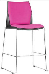
Fully Upholstered shell