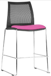
Mesh back, Upholstered seat